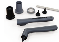
TotalExam® Lite Exam Camera & Otoscope