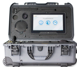
Transportable Exam Station

CostSimplified allows you the choice of telehealth delivery platforms to best meet your virtual care needs. Choose from an in-clinic mobile-all-in-one solution or ruggedized and transportable options.