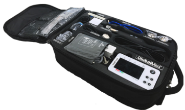
Transportable Exam Station